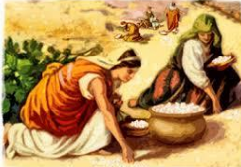
Evening Quail – Morning Mana

Exodus 16:13 And it came to pass, that at even the quails came up, and covered the camp: and in the morning the dew lay round about the host.